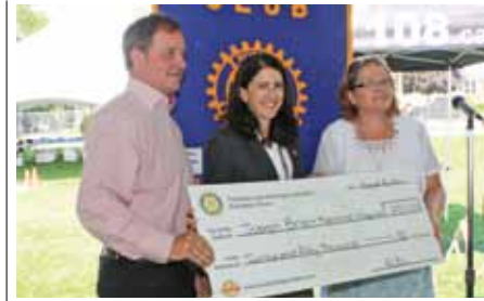
The Rotary Club of Burlington Lakeshore