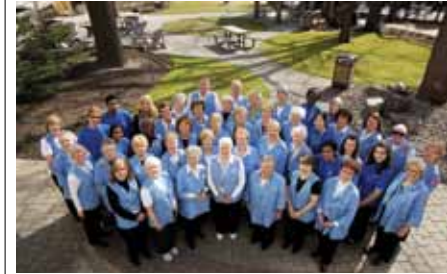
The Auxiliary to Joseph Brant Hospital