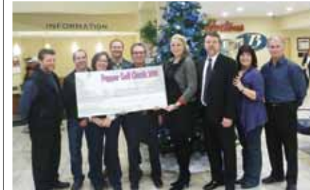
Pepper Golf Classic