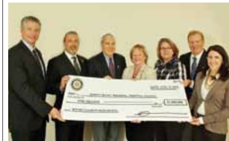
The Rotary Clubs of Burlington